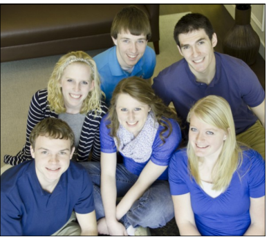
Faith Baptist Bible College